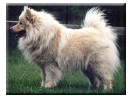
Blonde or cream color

The coat must be thick, profuse, harsh and weather resistant. The outer coat is not particularly shiny, but has a matte like look to it. This is the proper water resistant coat which will insulate the dog. Undercoat should be profuse and cause the outer coat to stand up. Outer coat may have a slight wave, which is not preferred, but is permissible as long as it is still harsh. A wavy coat is common on younger dogs, less than two years of age, and will often "mature" to a straight coat. Outer coat should not be so long that it hangs. A flat coat is quite faulty, and would put the dog at a disadvantage in an Arctic environment. Coat on the face, forehead, and fronts of legs is shorter, length of the ruff is more pronounced in males than females, ears are well furred.