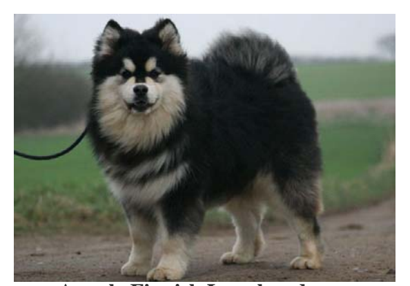
A male Finnish Lapphund

Although a Finnish Lapphund should be easily recognizable as a member of its breed, this is not a cookie-cutter breed. Each dog is unique in its own way. This is particularly emphasized by color, as the wide variety of colors available leaves few dogs that are identically marked.