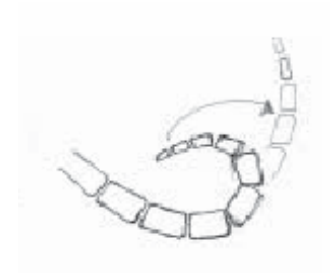
Correct J-hook, which can be straightened

The tail is not tight to the back. It is over the back when moving, but may drop when standing. It is set on slightly lower than the topline, so there is a discernable rise above the tail. It should never be kinky, but may have a J hook in the end.