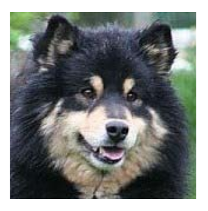
A Lapphund male with lovely expression.