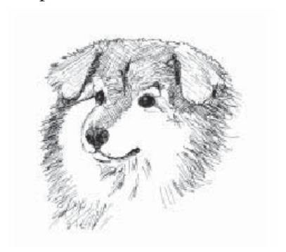
Incorrect drop ears

Ears are medium in size, somewhat rounded at the tip and well furred, but not so small as to be lost in the heavy ruff around the face. (Note: large ears are very common in the breed, but not considered ideal.) The inner edge of the ear should be set on at a level even with the center of each eye. Ears may be erect or tipped. Both are perfectly acceptable. Tipped ears break at approximately mid-ear or higher, so that the folded ear covers no more than the erect portion. Drop ears, which are incorrect, break below the mid-point of the ear, often at the base, so that the lobe of the ear hangs down past any erect portion.