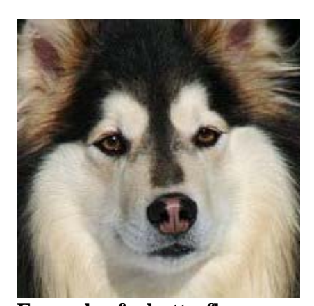
Example of a butterfly nose

General impression of the head, particularly when looking straight into the face, is very soft. The expression should be tender and rather like a teddy bear. When viewed from the front, the face has a rounded appearance. The frontal furrow, between the eyes, is clearly visible, even in a heavy coated dog Coloring in the face varies tremendously. Markings may or may not be present and may vary considerably in color. Nose leather, lips, and eye rims should be black in dogs which carry black pigment, but are, by necessity, brown in brown dogs. Blonde dogs often have pale or flesh colored noses, which is tolerated but not preferred. Butterfly noses are common and are also tolerated but not preferred.