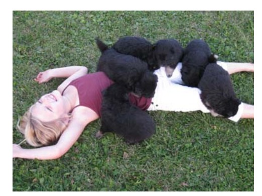
Children and Lappies go together well

A correct tail, when hanging down, will reach almost to the hock (the actual tail, not the hair) and will not be curled or curved. A J-shaped "shepherd's hook" at the very end of the tail is permissible, but not preferred. It should be possible to straighten it out with the fingers. A kink in the tail, caused by the fusion of two bones, is a very serious fault.