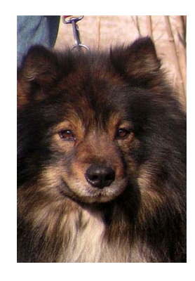
Two examples of good heads, proper eyes and ear set.