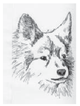
Ears too large