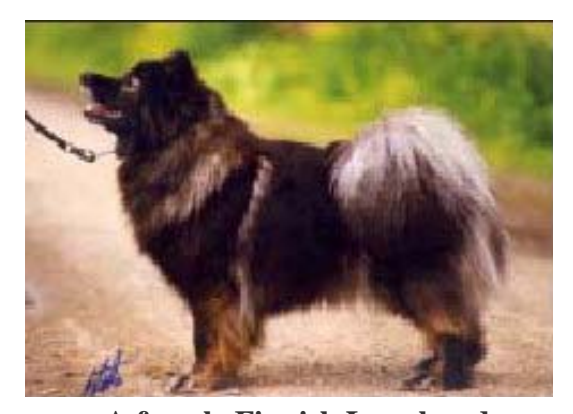
A female Finnish Lapphund

An ideal male stands 19.5 inches at the shoulder and an ideal female is 17.5 inches. The acceptable range is a variation of 1.5 inches in either direction from these ideals. However, there is no size disqualification and the overall quality of the dog is much more important than the size. Bigger is not better in this breed, and the best specimens are often in the bottom half of the size range.