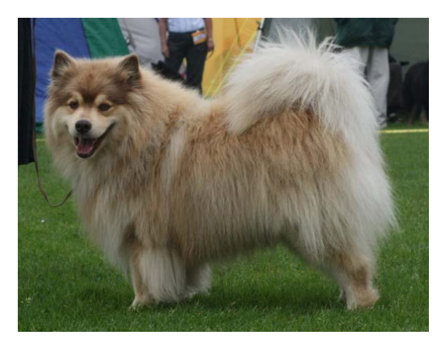
Structure - Standing

Standing, from the front and from the rear, limbs are parallel. Front and rear angulation should be well balanced, clearly marked, but not over angulated. A properly laid back shoulder results in front legs which are well under the body, giving the dog a visible, but not pronounced, forechest. Pasterns are slightly oblique and flexible, neither too upright nor too bent. The rear should appear powerful, with well defined angles, muscular thighs, and a rather short hock.