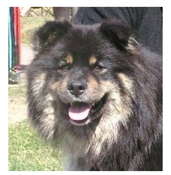
Correct tipped ears