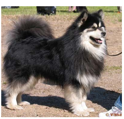
A male with good body proportions