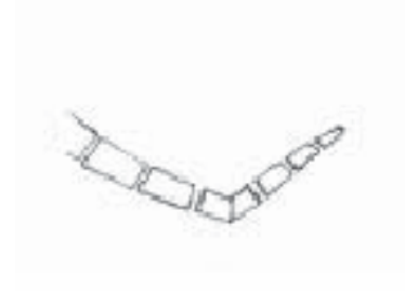
Incorrect fused bones

A Finnish Lapphund which is standing, at ease, is calm and serene. This dog will quite likely drop its tail, as the breed does not have a tight tail set. Dogs (males in particular) are often willing to stand and bait with their tail over their back, but it is not a fault for a standing dog to drop its tail. In females, this is even more common. Both sexes should carry their tail over and touching their back or side when moving. It is important in distinguishing this breed from other spitz-type dogs, to understand that the