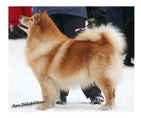
Not a brown, this is a richly colored blonde