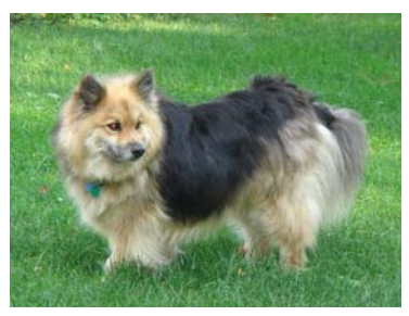
Faulty Saddle color

Brindle – "stripes" of tan alternating with black. Because of the long coat, this color often looks rather mottled. Individual hair shafts are one color or the other, so this is not considered to be a solid color. Merle – this color does not exist in the breed.