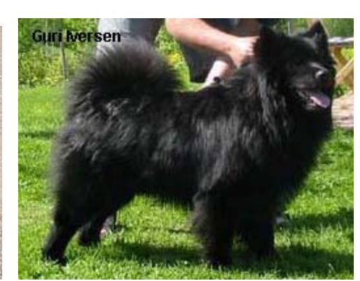
The Swedish Lapphund

The Swedish Lapphund is quite similar to the Finnish Lapphund, but was developed by breeders in Sweden from original breeding stock acquired from the portion of Lapland which is primarily in Sweden. Swedish Lapphunds are nearly always solid black, and slightly smaller than Finnish