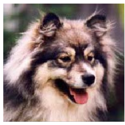
A Lapphund female with lovely expression.